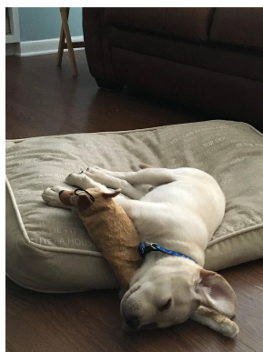
This is what safe really looks like.

Have you been told that dogs love their crates because they are like a den and they feel protected and safe? Have you been made to feel like a failure because your dog has no manners? Have you been advised to turn a deaf ear to your dog's cries for help? Those who have a stake in us buying these narratives will likely protest this article but their opposition will be self-serving and weak. Frightened, unhappy, and anxious dogs, who are crying out for attention, require attention. Dogs suffering separation anxiety and claustrophobia need to be supported and loved, not locked in boxes.