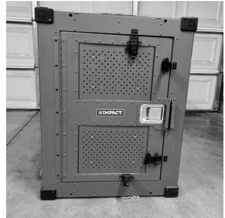
A 'High Anxiety' Crate

A skeptical person would want to know how this magic works. The vocalizing and exertion a desperate dog expends in trying to escape an inescapable crate strains, drains, and exhausts them physically, emotionally, and psychologically. Eventually, hopelessness sets in and their spirit is crushed.